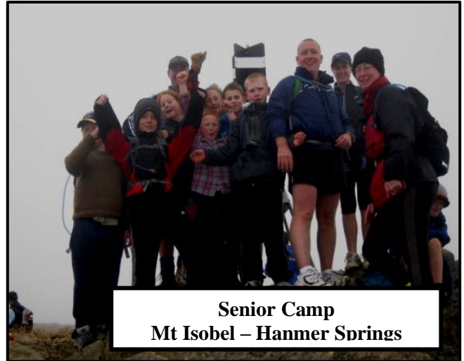
Senior Camp Mt Isobel – Hanmer Springs

Contact Mac on 03 7897830 Or 0274 879 655